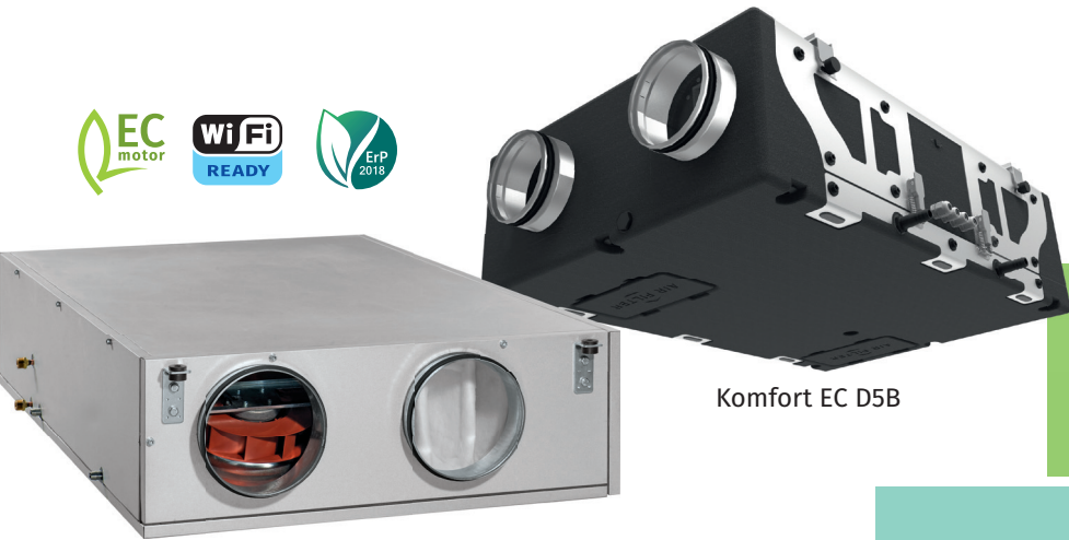
Komfort EC D5B